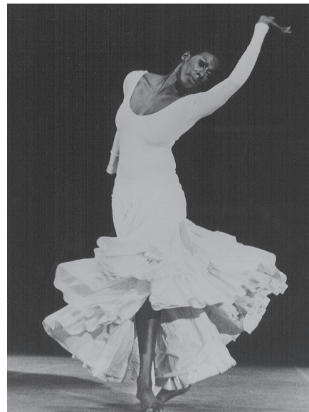
Judith Jamison in Alvin Ailey's Cry.

directorship, her idea of a permanent home for the AILEY organization was realized.