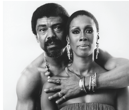
Alvin Ailey & Judith Jamison.

Ms. Jamison was the recipient of numerous awards and honors, including a primetime Emmy Award, a Kennedy Center Honor, and a National Medal of Arts. As a highly regarded choreographer, she created many celebrated works. Her autobiography, Dancing Spirit , was published in 1993, and in 2004, under her artistic