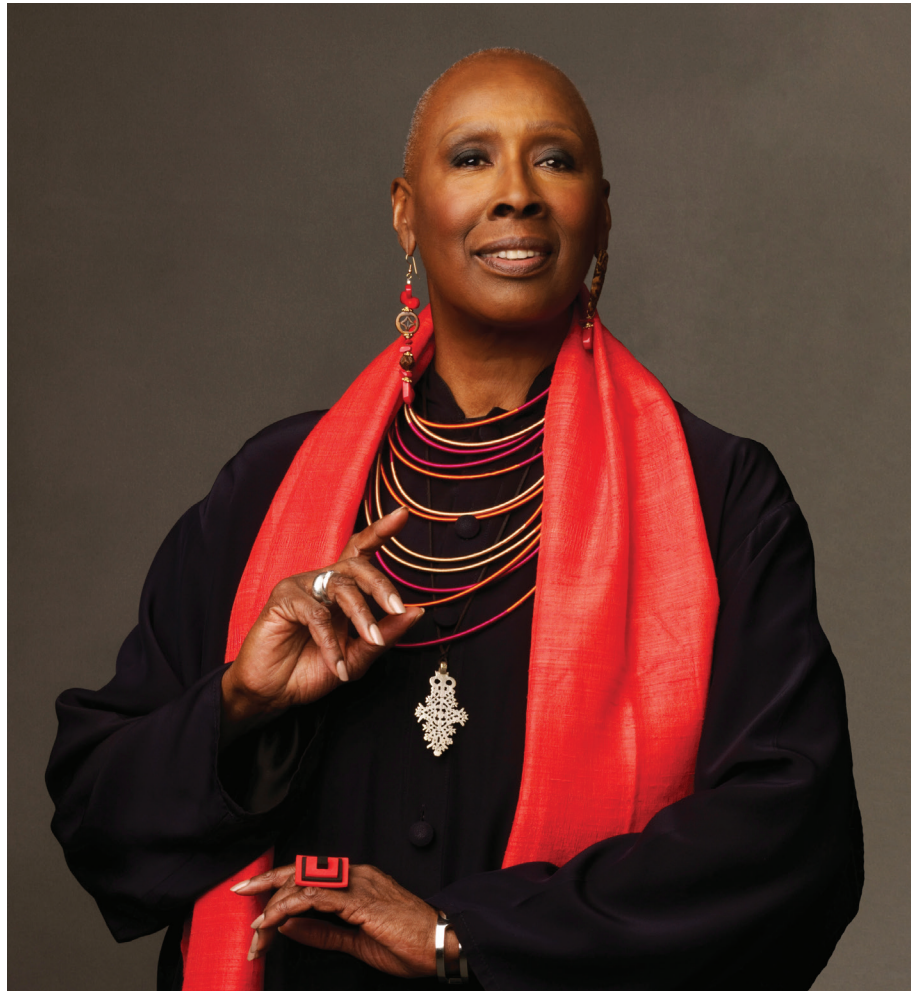
Judith Jamison.

When Judith Jamison walked into a room, she had your attention. You might actually have heard her before you saw her because she always made it a point to say hello to everyone and expected the same in return. She cared deeply for everything that Alvin Ailey created, so much so that she ensured AILEY would always have a permanent home: The Joan Weill Center for Dance.