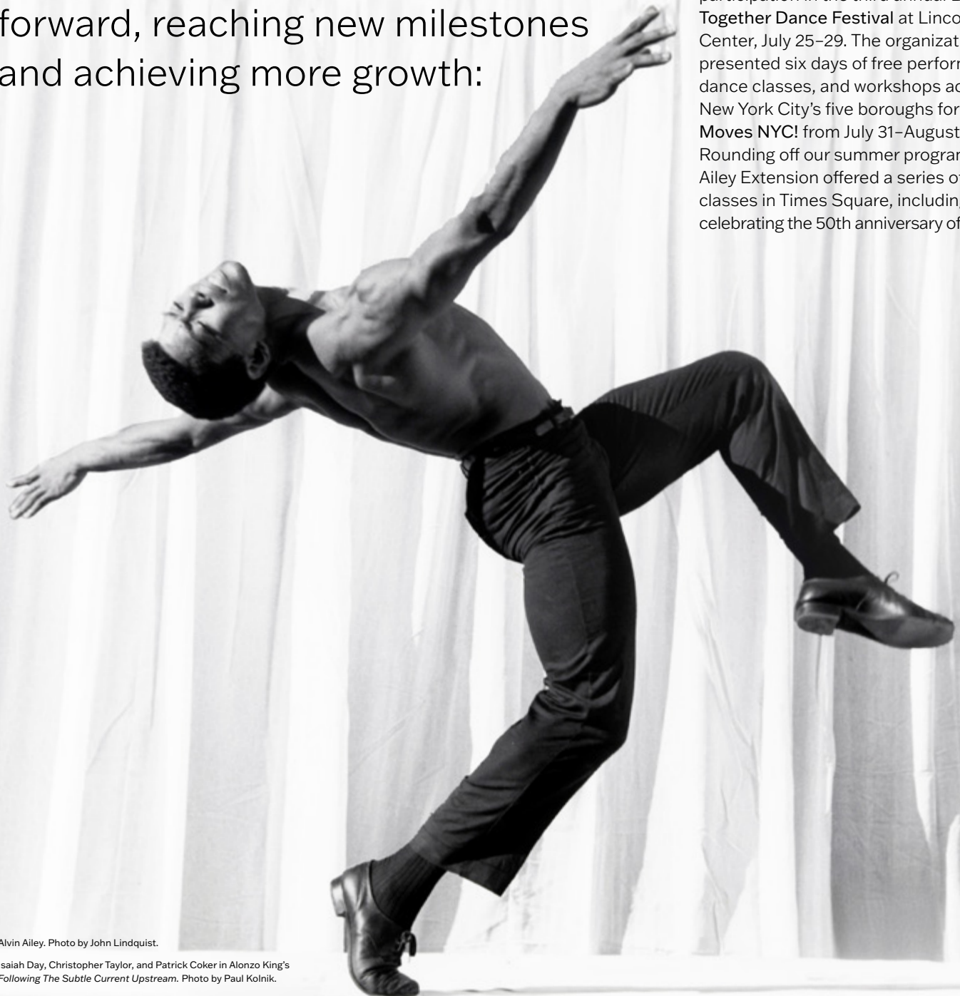
Alvin Ailey.

AILEY continued to offer free summer programming in 2023, beginning with Alvin Ailey American Dance Theater's participation in the third annual BAAND Together Dance Festival at Lincoln Center, July 25–29. The organization then presented six days of free performances, dance classes, and workshops across New York City's five boroughs for Ailey Moves NYC! from July 31–August 5. Rounding off our summer programming, Ailey Extension offered a series of free classes in Times Square, including one celebrating the 50th anniversary of hip hop.